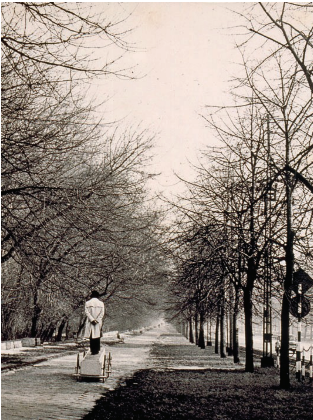
Krzysztof Wodiczko, vehicle, 1973.

The German scholar Boris Groys (2008, p.184ss.), in the essay “El museo en la era de los medios” (The museum the era of the media) argues about the importance of the art museums in our days, an era of supremacy of the media. Even at the risk of simplifying his ideas, I believe that bringing them into this discussion will help to understand what an art museum like the MAC can mean to a University such as USP.