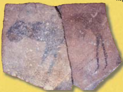
Oldest evidence of painting in Africa from Apollo 11 Rock Shelter in Namibia: 28,000 years old