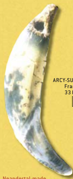
Neandertal-made pierced tooth from Arcy-sur-Cure, France: 33,000 years old

Recent finds, including those from Blombos Cave in South Africa, are revealing that many sophisticated practices emerged long before 40,000 years ago at sites outside of Europe, suggesting that humans were our cognitive equals by the time they attained anatomical modernity, if not earlier. Indeed, the fact that at least some Neandertals appear to have thought symbolically raises the possibility that such capacities were present in the last common ancestor of Neandertals and H. sapiens . The map below shows the locations of the sites mentioned in the article.