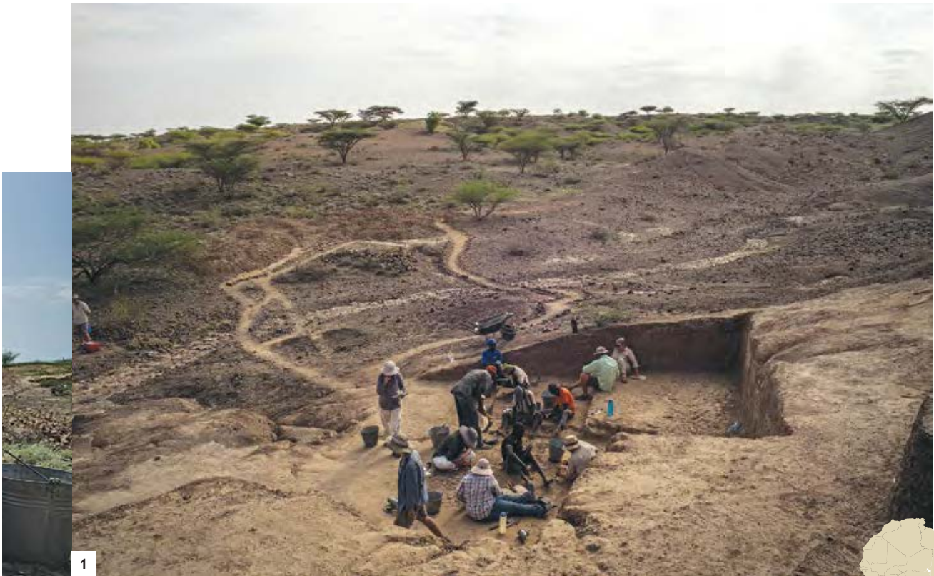
WORKERS DIG into the side of a hill at Lomekwi 3 in July 2016, looking for artifacts (1). They sift each bucket of sediment they remove, hoping to recover even the smallest fragments of interest (2). Every pebble is studied for signs of human modification.

tools that gave it access to a wide variety of food sources, including the animals that grazed on these new plants. With the rich stores of calories from meat, Homo could afford to fuel an even bigger brain, which could then invent new and better tools for getting still more calories. In short order, a feedback loop formed, one that propelled our brain size and powers of innovation to ever greater heights. By one million years ago the robust australopithecines disappeared, and Homo was well on its way to conquering the planet.