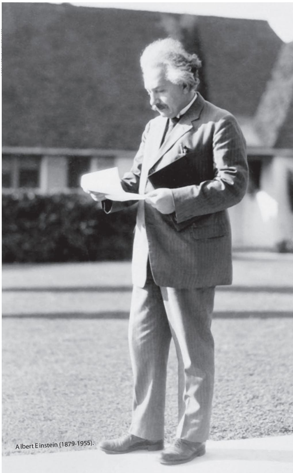
Albert Einstein (1879-1955).