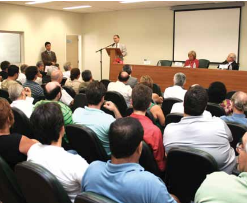
Inauguration of Ribeirão Preto Hub