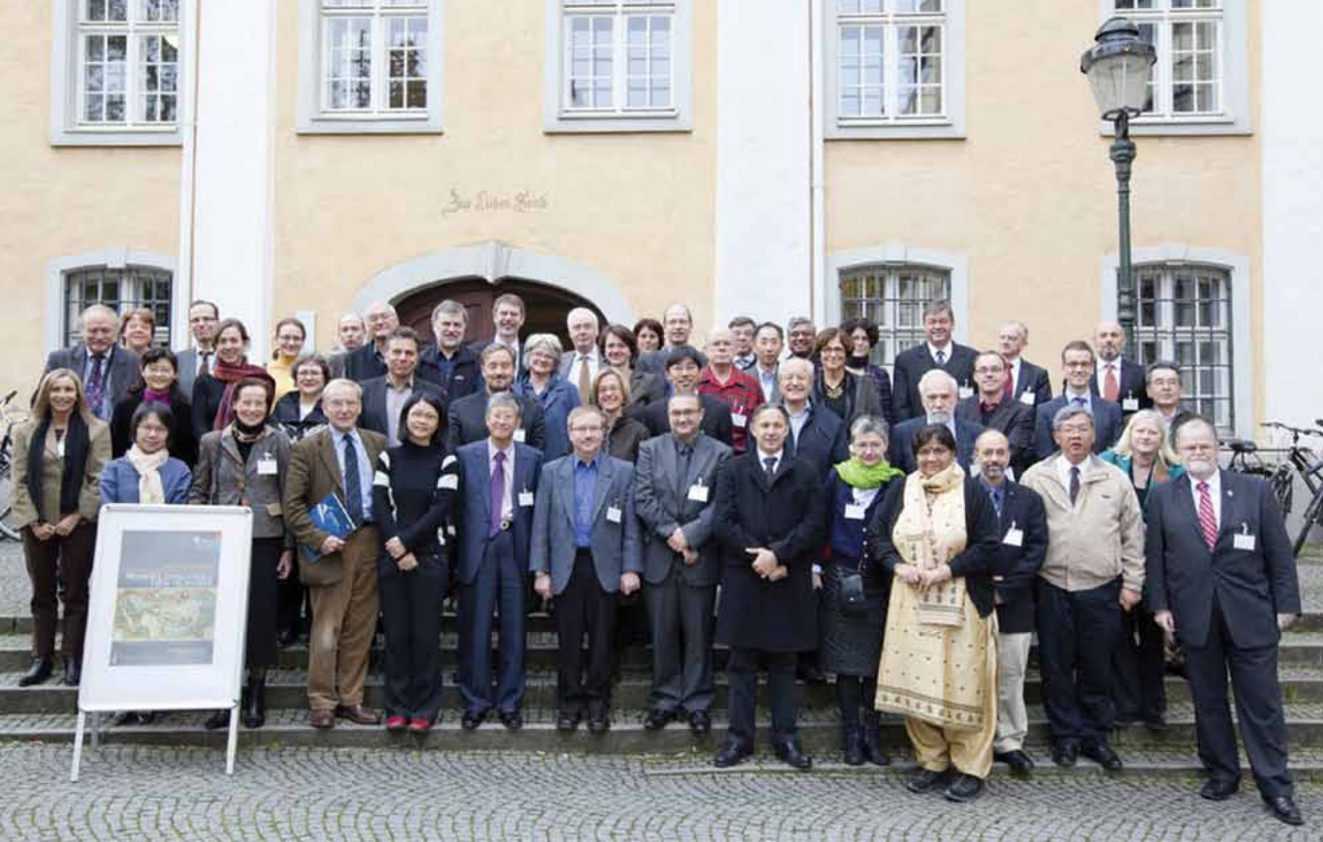
IEA-USP participated in the conference that brought together directors of 32 university-based institutes of advanced studies from 19 countries on October 2010, in Freiburg, Germany, hosted by the Institute of Advanced Studies at the University of Freiburg.