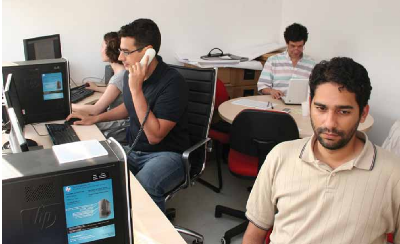
Some of the Observatory members at work